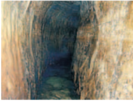
Inside view of Hezekiah's tunnel, displaying the thick limestone through which workers had to dig.

was determined to maintain a firm grasp on his vassal states, which meant that he would be forced to invade the cities of Judah if Hezekiah continued to defy Assyria's might (Hoerth, 1998, pp. 341-352). Knowing that Sennacherib would not sit by idly and watch his empire crumble, King Hezekiah began to make preparations for the upcoming invasion. One of the preparations he made was to stop the water from the springs that ran outside of Jerusalem, and to redirect the water into the city by way of a tunnel. Second Kings 20:20 records the construction of the tunnel with these words: "Now the rest of the acts of Hezekiah—all his might, and how he made a pool and a tunnel and brought water into the city—are they not written in the book of chronicles of the kings of Judah?"