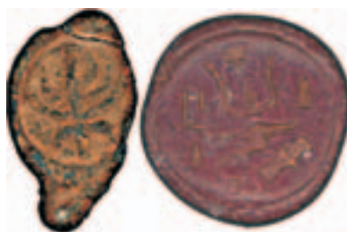
On the left, a bulla with Hebrew writing in a slightly oval impression. On the right, a stamp seal with the name of the owner or scribe.

The biblical text, however, offers the answer to this historical enigma. Due to Hezekiah's faithfulness to the Lord, Jehovah offered His divine assistance to the Judean King. In the book of Isaiah, the prophet was sent to Hezekiah with a message of hope. Isaiah informed Hezekiah that God would stop Sennacherib from entering the city, because Hezekiah prayed to the Lord for assistance. In Isaiah 37:36, the text states: