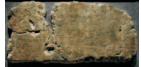
The Siloam inscription commemorates the excavation of Hezekiah's Tunnel. Archaeological Museum, Istanbul, Turkey.

In addition to Hezekiah's tunnel, other amazingly detailed archaeological evidence provides an outstanding record of some of the events as they unfolded between Hezekiah and Sennacherib. Much of the information we have comes from the well-known Taylor Prism. This fascinating, six-sided