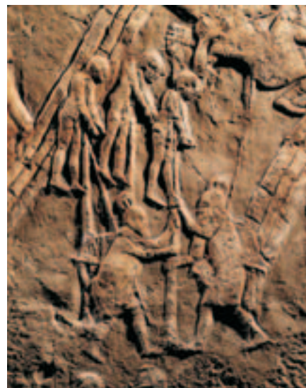
Assyrian warriors shown impaling Jewish prisoners. Part of a relief from the palace of Sennacherib. British Museum, London.