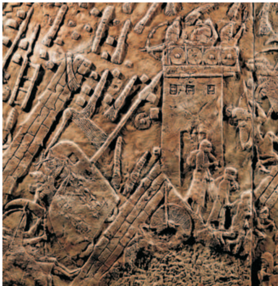
Assyrians attack the Jewish fortified town of Lachish. Part of a relief from the palace of Sennacherib at Nineveh. British Museum, London.

Stern also discussed the flaming firebrands that the defenders of Lachish launched at their attackers, the long-handled, ladle-like instruments used to douse the front of the battering rams when they were set on fire, slingmen, archers, and assault troops with spears. One of the most striking features of the relief is the depiction of the tortures inflicted on the inhabitants of the Lachish.