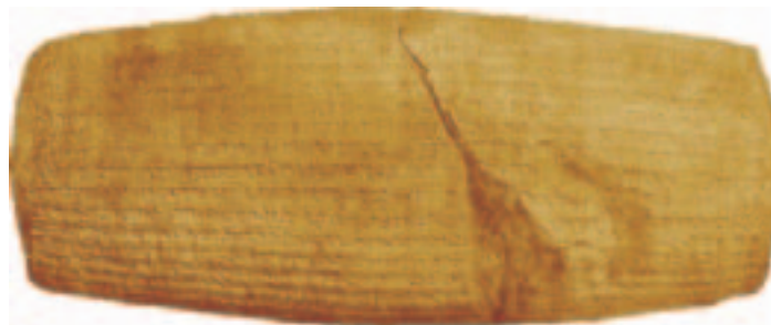
The Cyrus Cylinder

The policy, often hailed as Cyrus' declaration of human rights, coincides with the biblical account of the ruler's actions, in which Cyrus decreed that the temple in Jerusalem should be rebuilt, and that all the exiled Israelites who wished to join in the venture had his permission and blessing to do so (Ezra 1:1-11). The little nine-inch-long clay cylinder stands as impressive testimony—along with several other archaeological finds—to the historical accuracy of the biblical text.